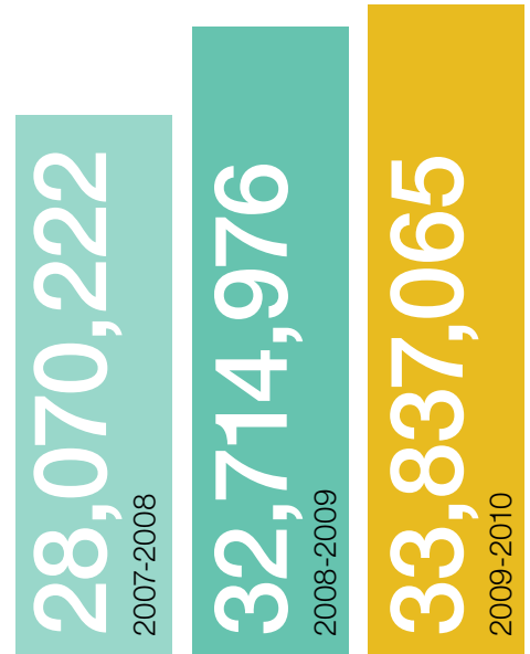
Our Expenditures over the past 3 years

Audited financial statements are available upon request please e-mail us at info@surreyplace.on.ca or call (416) 925-5141.